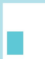
1/4 page: 80 x 115 mm