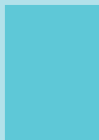
1/1 page: 210 x 280 mm