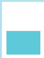
1/2 page: 166 x 115 mm