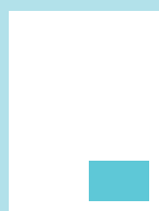
1/8 page: 80 x 54 mm