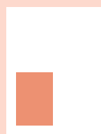
1/4 page: 80 x 115 mm