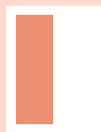
1/2 page: 80 x 237 mm