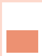
1/2 page: 166 x 115 mm