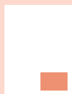
1/8 page: 80 x 54 mm